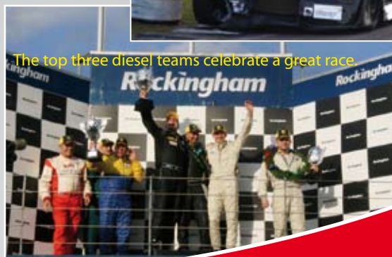
The top three diesel teams celebrate a great race