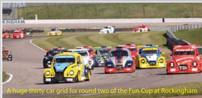
A huge thirty car grid for round two of the Fun Cup at Rockingham

Saturday 15th May, saw the Fun Cup arrive at Rockingham for round two of the Fun Cup, in the glorious sunshine for a seven hour race, with a huge thirty car grid. This race was to be a little different from all other Fun Cup races, with an hour lunch break after the first three hours and fifteen minutes and all teams allowed to work on their cars for the final twenty minutes of the break.