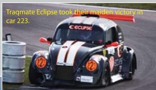
Traqmate Eclipse took their maiden victory in car 223.

The fastest TDI lap was a 1:38.062, set by race winners, car 223 Traqmate Eclipse.