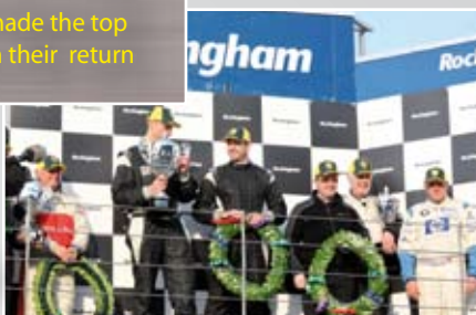
The petrol winners celebrate on the podium.

The second part of the race saw the gap to the 3rd placed car open up, after car 41 was caught behind the safety car for the second time, losing a lap each time to the three leaders. Hasty pitstops saw them in a secure 4th place again for the last stint when the lead car JPR 102 started dropping down the order, promoting the 3rd spot to Prestige Motorsport.